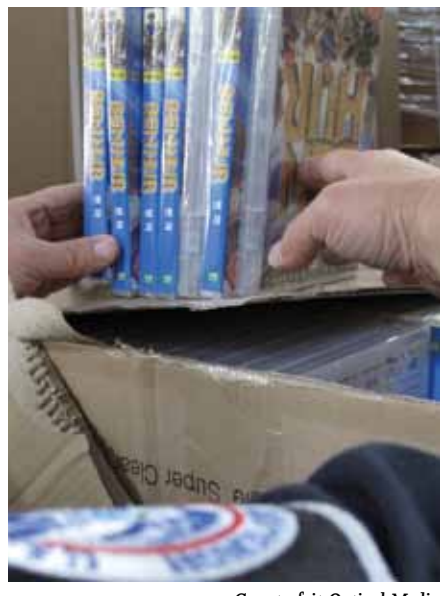
Counterfeit Optical Media