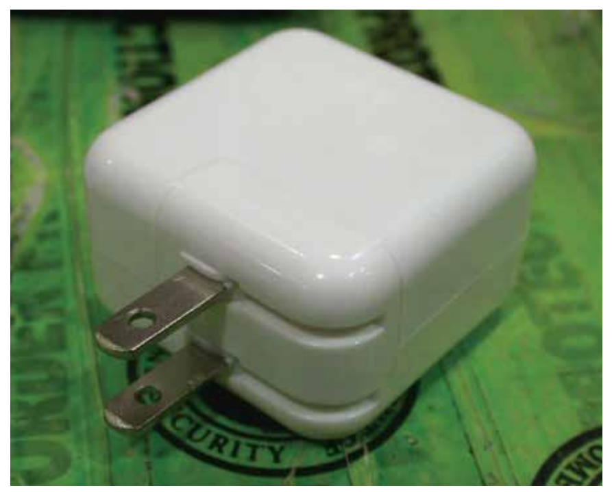
Counterfeit Electrical Component