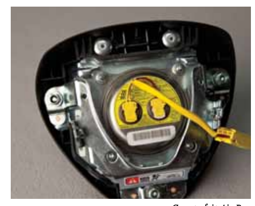
Counterfeit Air Bag

offices with contact information can be found at www. cbp.gov/ipr. Product identification training in respect of ITC exclusion orders must first be coordinated with the IPR and Restricted Merchandise Branch.